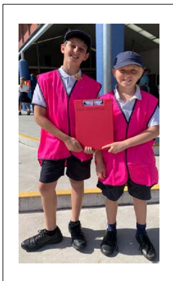
Photos: Our peer mediators on active duty this term in easily identified fluoro vests.

Term 2 sees the introduction of our Peer Mediation program. Highly visible in the playground at recess and lunch, our BHPS trained Year 6 students have been mediating minor conflicts between students. Mediators encourage students to find solutions to disagreements such as name calling, teasing, exclusion and friendship problems. Peer Mediation forms part of our Student Welfare program at BHPS and includes opportunities for our Year 6 students to develop skills in and leadership and confidence. Feedback from students, teachers and peer mediators is extremely positive."