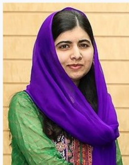
Yousafzai in 2019