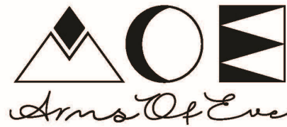
Arms of Eve