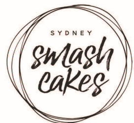
Sydney Smash Cakes

We also have the following Year 6 families to thank who have sourced or sponsored prizes for the raffle