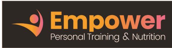
Empower Personal Training & Nutrition